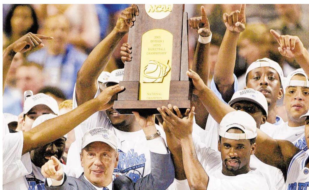
Roy Williams and UNC celebrate their NCAA title in 2005